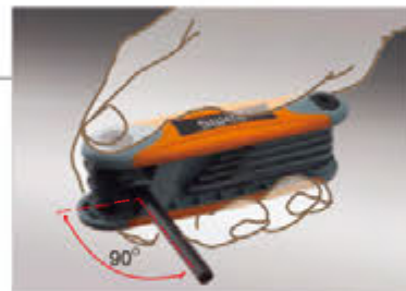
90° stop feature.