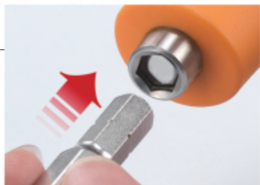
Quick insert and release bits from the short end.